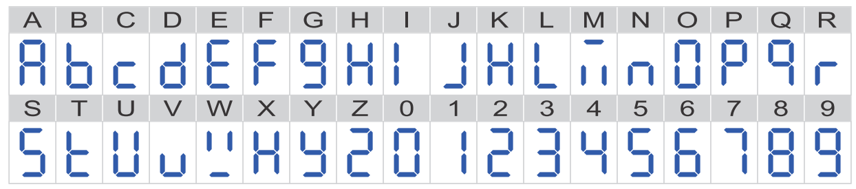
The digits used to represent letters and numbers

The buttons on the front of the display are used to navigate through the solar charger readings and are used when making solar controller and display settings. They have the following functions: