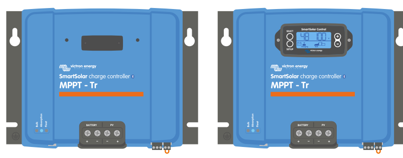
Example of a solar charger without display and with display

These solar chargers can also be recognised by a small plastic cover on the front face with the text "display option".