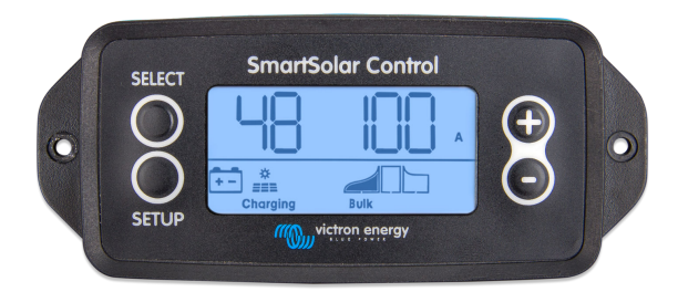
SmartSolar Control front view