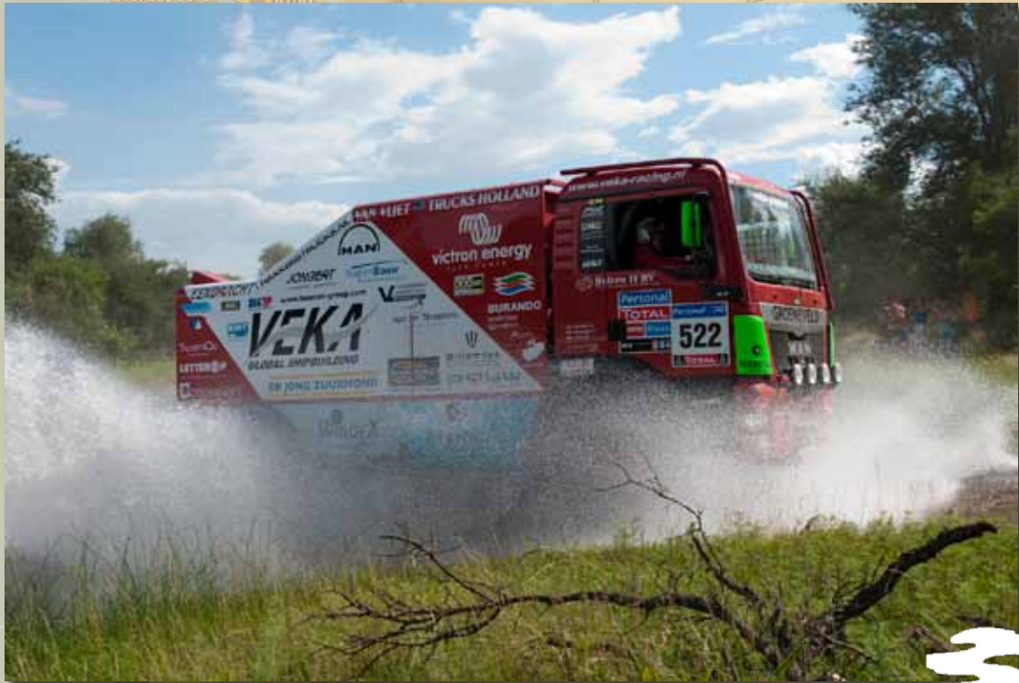
Photo 5: Truck 522 with Peter Versluis, Cor Euser and Pieter van Kruijsdijk.