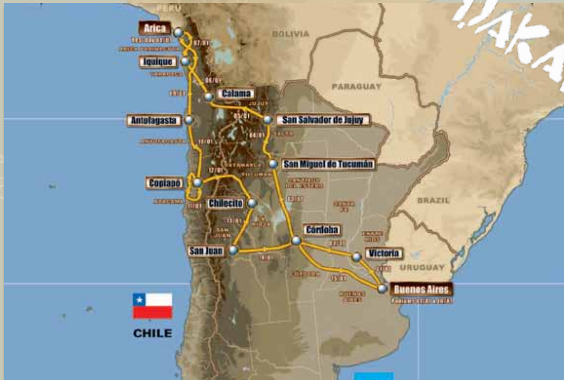
Photo 8: DAKAR-route, starting and ending in Buenos Aires, Argentina.