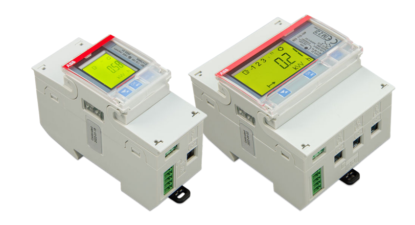
ABB B21, B23 and B24 Energy Meter