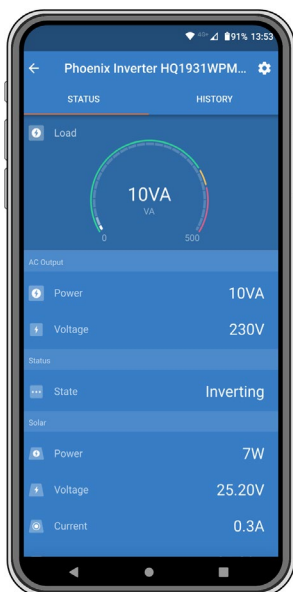
The VictronConnect app