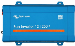
Sun Inverter 12/250