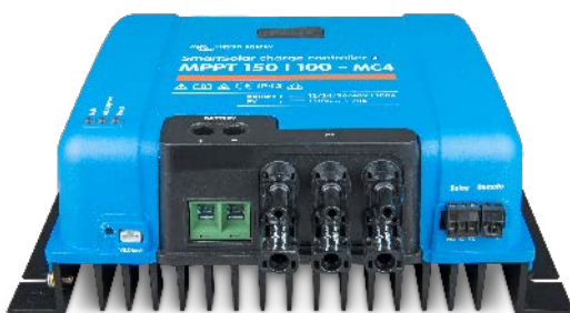
SmartSolar Charge Controller MPPT 150/100-MC4 without display