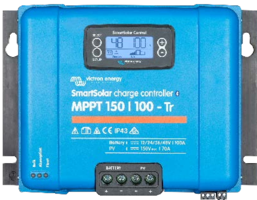
SmartSolar Charge Controller MPPT 150/100-Tr with pluggable display