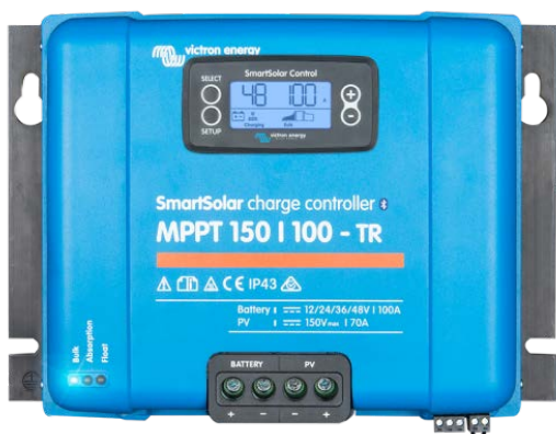
Solar Charge Controller MPPT 150/100-Tr with pluggable display