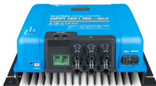
Solar Charge Controller MPPT 150/100-MC4 without display