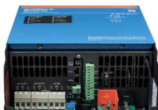
Connection Area MultiPlus-II 4k5