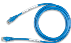
VE.Can to CAN-bus BMS cable