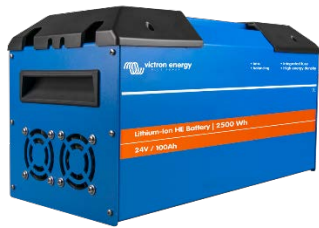
24V/100Ah HE battery