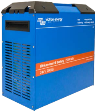
24V/200Ah HE battery