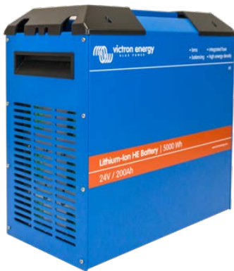
24V/200Ah HE battery