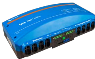
Lynx-ion BMS 1000A