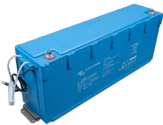
Secured with mounting brackets