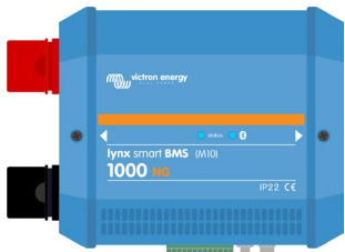
Lynx Smart BMS NG 500 A & 1000 A