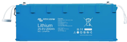
25,6 V 200 Ah Lithium NG battery