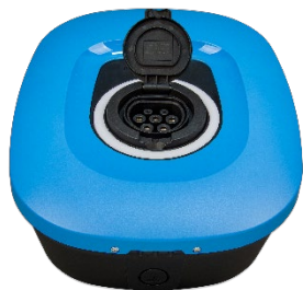
EV Charging Station NS - Front