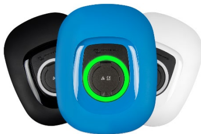
Black, blue (default) or white front