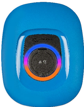
EV Charging Station NS