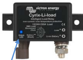
LED status indicator