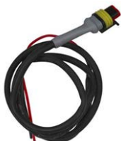
Control cable for Cyrix-ct 12/24-230 Length: 1 m