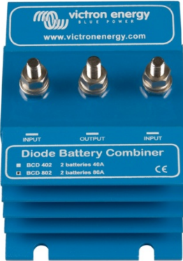
Argo Diode Battery Combiner BCD 802

Diode Battery Combiners are used to guarantee continuous DC power to mission critical equipment, such as an electronic engine control system. With a diode battery combiner two or more DC power sources can be used in parallel to supply the mission critical load. Failure of one source will not interrupt power to the critical load.