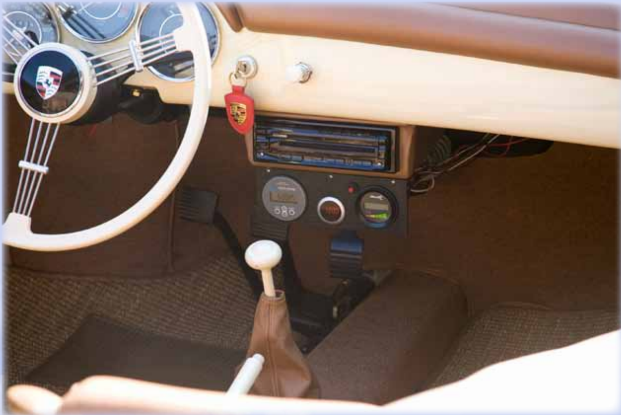
Photo 1: Inside of the 'Speedster Part Duh', with the BMV-600HS installed in the dashboard.