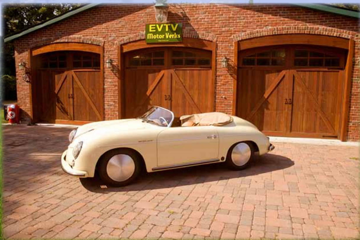
Photo 2: The vehicle conversion of the 1957 Porsche 356, named 'Speedster Part Duh'.