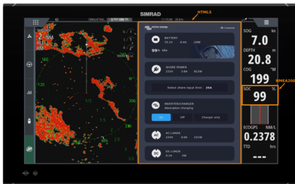
Picture showing the two integration options, NMEA2000 and HTML5 App. Click to see full size and see the difference between the two.

Make sure to closely read this full document to find the best method for your type of system.