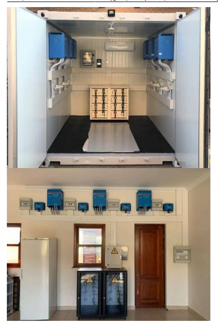
Installation image courtesy of 'Get Off Grid' South Africa.