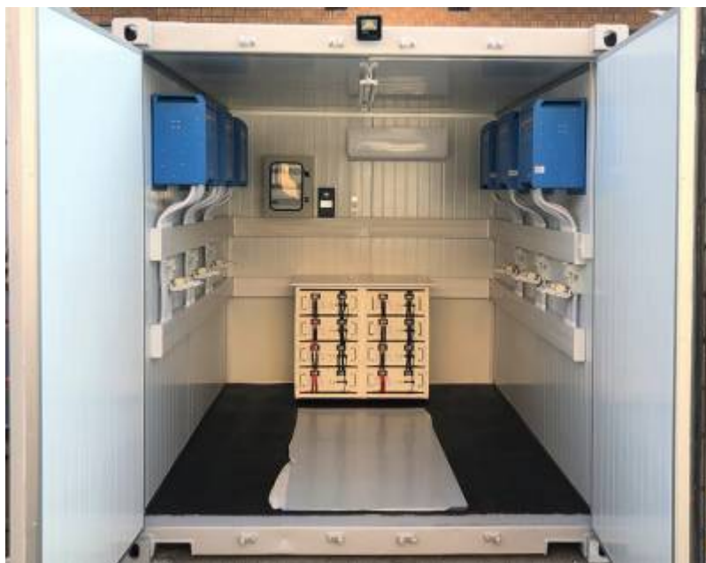
Installation image