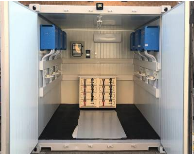
Installation image courtesy of 'Get Off Grid' South Africa.